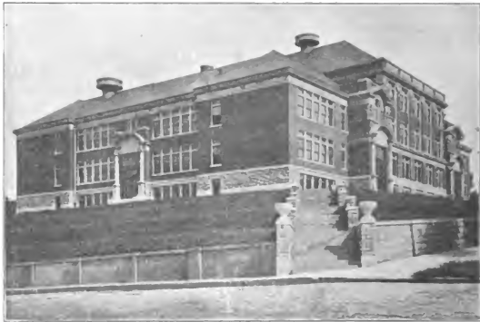
A MODERN HIGH SCHOOL BUILDING.

High Schools. —The high schools of the state may be divided into three classes: the city high school, which constitutes the ninth, tenth, eleventh and twelfth grades of the district school and is governed by its laws; the county high school, and the Barnes high school. The county high school was first established in 1886 by a law which read: "Each county having a population of 6,000 inhabitants or over, as shown in the last state or federal census, may establish a county high school on the conditions and in the manner hereinafter prescribed for the purpose of affording better educational facilities for pupils more advanced than those attending district schools and for persons who desire to fit themselves for the vocation of teaching." The first county high school was founded in 1889, five were established in the decade from 1890 to 1900, and sixteen more in the period 1900-1905. All county high schools are required by law to have "three courses of instruction,